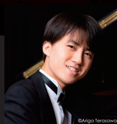
Piano Tomoharu Ushida

THURSDAY 29 MAY 2025, 19:00 THAILAND CULTURAL CENTRE, MAIN HALL